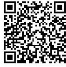
SCAN QR CODE HOTEL MAP